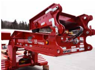
Removable flip up extension