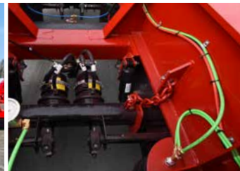
Suspension with chain stopper