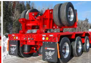
Removable flip up axle