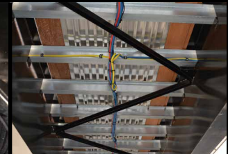
Weight Saving Aluminum Cross Members