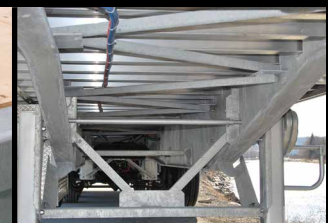
100% Galvanized Structure