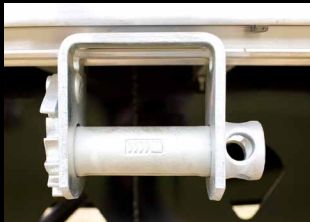
Cargo Securement – "LL" track, winches and chain ties