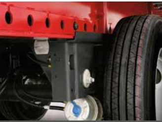
Optional slider bogie