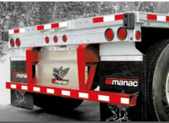
Galvanized rear sill with closed bumper