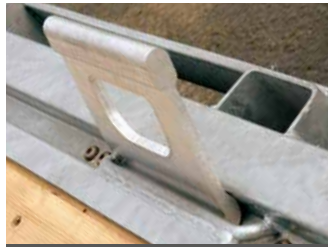
Unique cargo securement anchor point (cargo hand style) Galvanized side rails